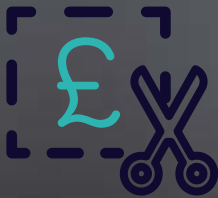
Preventative Care Vouchers

It also provides details of the following Optional sections of cover: