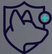
Public Liability (Dogs Only)